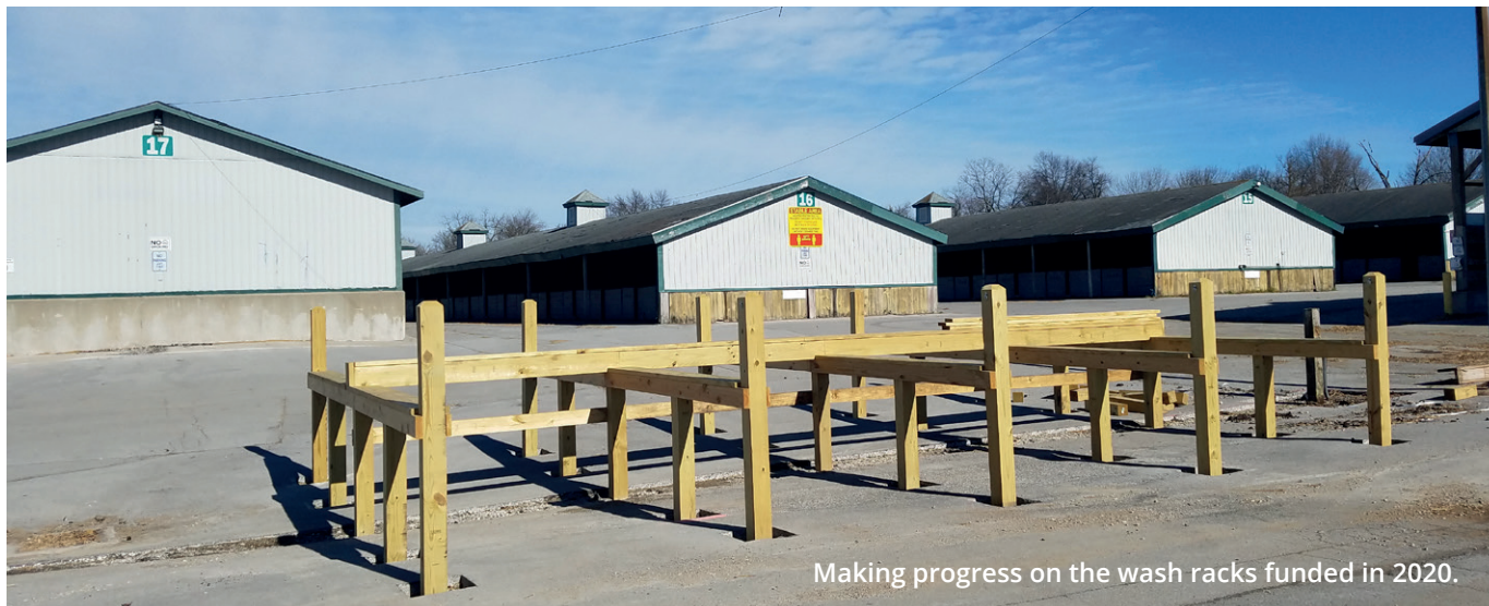
Making progress on the wash racks funded in 2020.